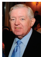
Karl Michaelis Lissner Charitable Trust